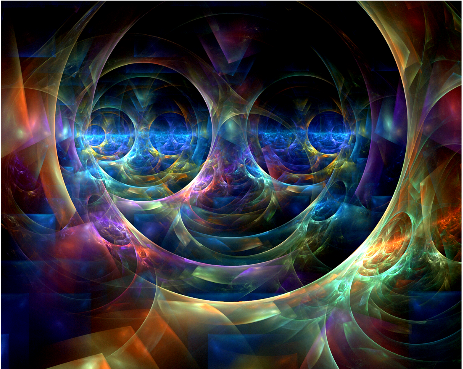
Wonderland by cygx1

This is the opening of our awareness to the wonderland of experiencing the presence of God, Jesus, spiritual guides, angelic beings, intuitions, guidance, divine messages, visions, heightened abilities, and other mystical phenomena of the awakened consciousness.