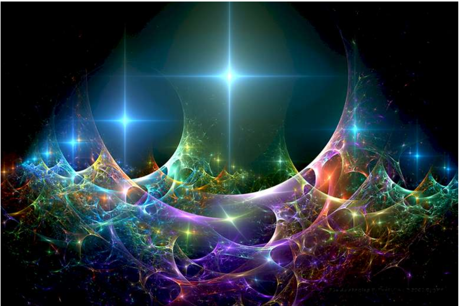
The Awakening versus evolution by cygx1

This is often experienced as a still mind and a full heart. It may initially be a momentary flash or peak experience. As it comes into our awareness more and more, this peaceful, joyful simple feeling of being can become a normal way of living. From this place we can witness the busy, conflicted world without losing our peacefulness. We can then manifest our part in healing the world, embodying God as a divine agent of love, light, and healing in our small part of the world. Since everything is connected, this then brings more love, light, and healing into all the world.