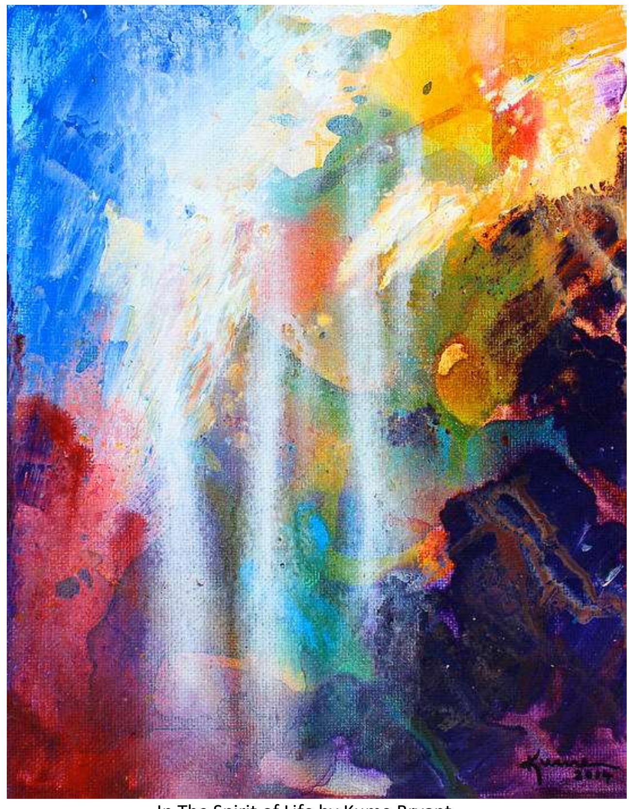
In The Spirit of Life by Kume Bryant Spirit-breath-consciousness is like a divine waterfall flowing down upon the earth.