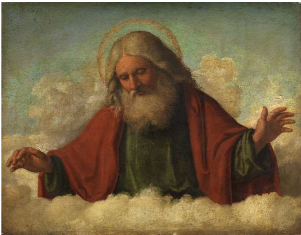
God the Father by Cima da Conegliano