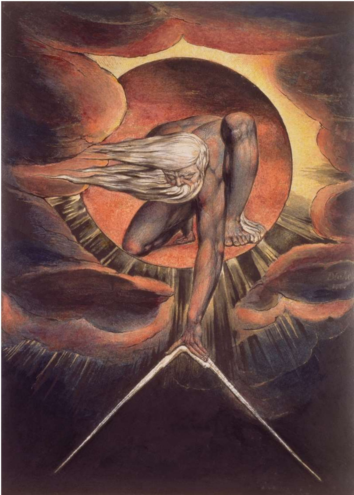
The Ancient of Days by William Blake 1757-1827 British Romantic era poet and painter