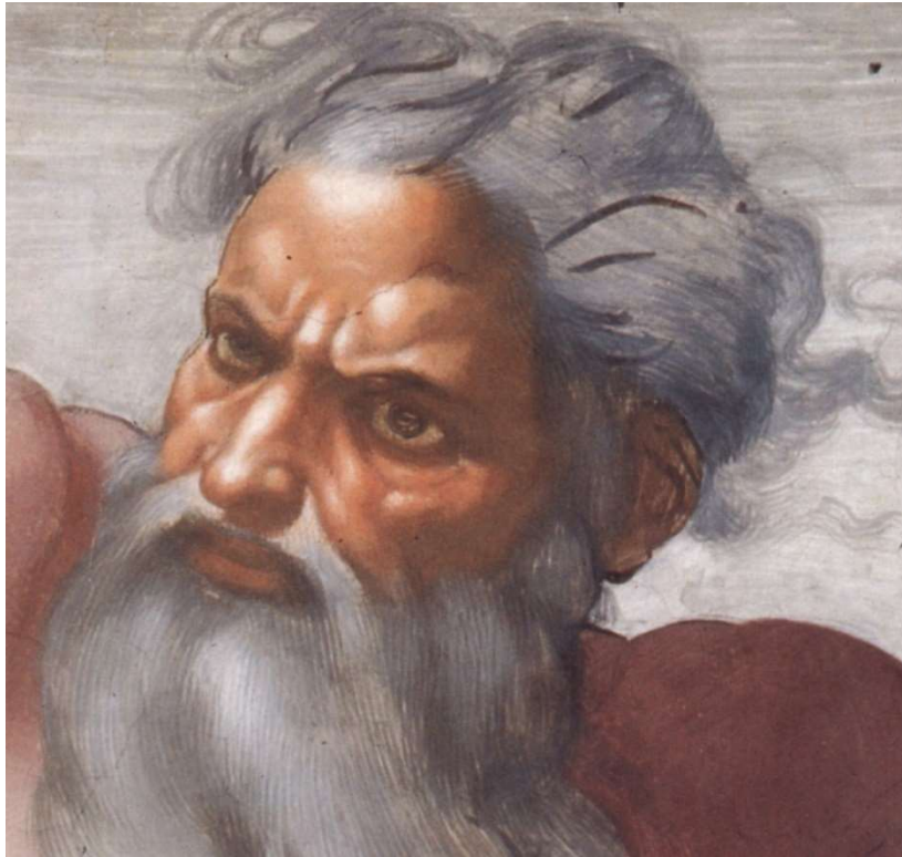
Creation of Sun and Moon by Michelangelo