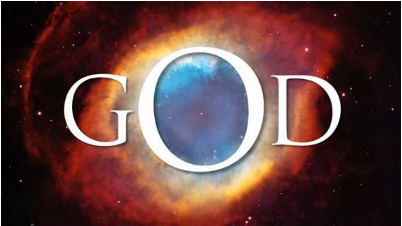
Helix Nebula Hubble Space Telescope 2003. Called the Eye of God

Jesus called the Face of God that was close to him by the name “Abba” which means something like Dad or Daddy today. This was the name used by young children from their earliest years to mature adults for their father.